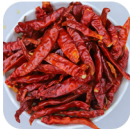
Stemless Dry Chillies