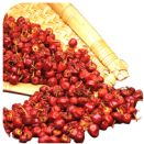
Gundu (S9) Chillies