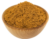
Meat Curry Powder