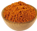
Fish Curry Powder