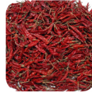
Teja (S17) Chillies