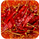
Whole Dry Chillies